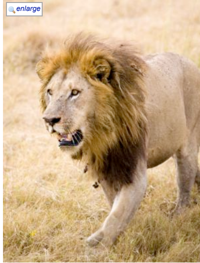
New research refutes the hypothesis that African lions consist of a single, randomly breeding population.